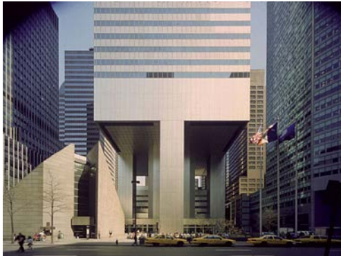
Figure 1. - The cantilevered corners and mid-face supports of the Citicorp Center.

faces of the building, with cutout cantilevered corners nine stories high on adjacent corners making room for the entrenched church below on one side and public space on the other. At the time, New York City offered monetary incentives for creating privately owned public spaces and the project used the second cantilevered corner to take advantage of this.